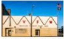
309 South 6th Street, Brainerd, MN