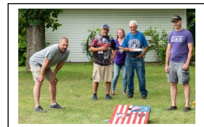
SEE YOU AT THE PICNIC