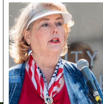
Aux Pres Sue