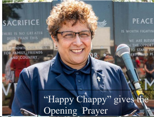
“Happy Chappy” gives the Opening Prayer