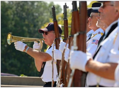
Taps is played during the Armed Forces Tribute Event on Friday, Sept. 15, 2023, at the All Veterans Memorial in Brainerd.